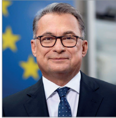
Dr. Joachim Nagel

Dr. Joachim Nagel is the President of the Deutsche Bundesbank and a member of the Governing Council of the European Central Bank. He studied Economics at the University of Karlsruhe where he earned his doctorate in 1997. Dr. Nagel joined the Deutsche Bundesbank in 1999. He held a series of increasingly senior roles, covering areas such as market analysis, banking supervision, financial stability, and information technology. From 2010 to 2016, he served as a member of the Executive Board of the Deutsche Bundesbank.